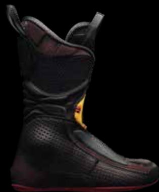
COCHISE 130 DYN GW

Der Innenschuh besteht aus Dual-Density-Mikrozellenmaterial, das langlebig und einfach anzupassen ist. Für eine perfekte Passform kann der C.A.S.-Innenschuh per Thermo-Verformung, Ausdrücken und Schleifen der Fußform noch genauer angepasst werden. Die neue Faltkonstruktion an der Rückseite des Schuhs erleichtert das Gehen.