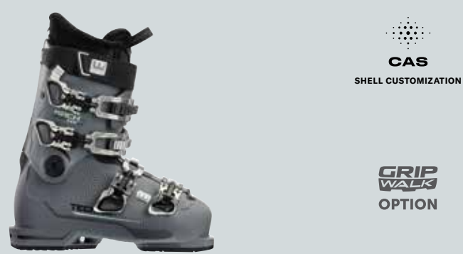
MACH SPORT HV 75 W RT COD: 201614 00 070 SIZES: MP 220 - 275

Shell: PU - Double Quick Instep Cuff: PP - Mechanical Cuff Adapt Liner: COMFORT- Sanitized® - Color Coding Canting: Double Ratchets: Adjustable top cuff ratchet Powerstrap: 35 mm strap Buckles: Mach Sport buckles, Adj. top cuff ratchet Soles: ISO 5355 Weight: 1840 g (MP 245)