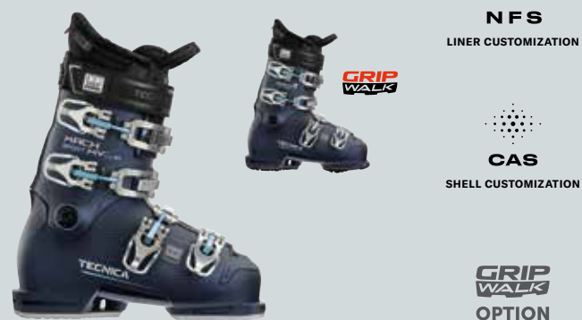
MACH SPORT MV 95 W RT COD (GW): 201603 G0 869 SIZES: MP 220 - 275 COD: 201603 00 869

Shell: PU - Double Quick Instep Cuff: PP Liner: SPORT- N.F.S.- Sanitized® - Color Coding Canting: Double Ratchets: Adjustable top cuff ratchet Powerstrap: 35 mm strap Buckles: Mach Sport buckles, Adj. top cuff ratchet Soles: ISO 5355 / GripWalk Weight: 1770 g / 1780 g (GW) (MP 245)