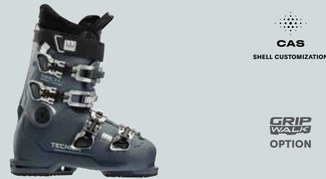
MACH SPORT HV 70 W RT COD: 201615 00 383 SIZES: MP 220 - 275

Shell: PU - Double Quick Instep Cuff: PP - Mechanical Cuff Adapt Liner: COMFORT- Sanitized® - Color Coding Canting: Double Ratchets: Adjustable top cuff ratchet Powerstrap: 35 mm strap Buckles: Mach Sport buckles, Adj. top cuff ratchet Soles: ISO 5355 Weight: 1860 g (MP 245)