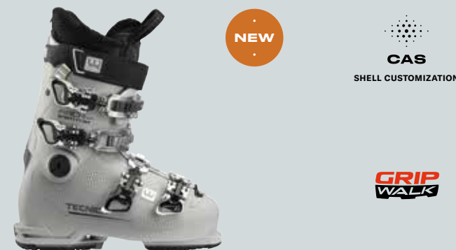
MACH SPORT HV 75 W RT GW COD: 201614 G0 200 SIZES: MP 220 - 275

Shell: PU - Double Quick Instep Cuff: PP - Mechanical Cuff Adapt Liner: COMFORT- Sanitized® - Color Coding Canting: Double Ratchets: Adjustable top cuff ratchet Powerstrap: 35 mm strap Buckles: Mach Sport buckles, Adj. top cuff ratchet Soles: GripWalk Weight: 1850 g (MP 245)