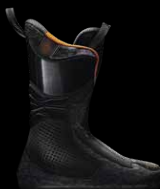
COCHISE 120 DYN GW COCHISE 110 DYN GW