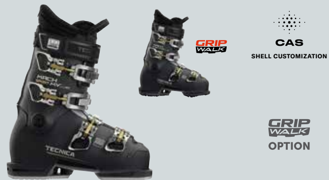
MACH SPORT MV 85 W RT COD (GW): 201604 G0 062 SIZES: MP 220 - 275 COD: 201604 00 062

Shell: PU - Double Quick Instep Cuff: PP Liner: COMFORT- Sanitized® - Color Coding Canting: Double Ratchets: Adjustable top cuff ratchet Powerstrap: 35 mm strap Buckles: Mach Sport buckles, Adj. top cuff ratchet Soles: ISO 5355 / GripWalk Weight: 1790 g / 1800 g (GW) (MP 245)